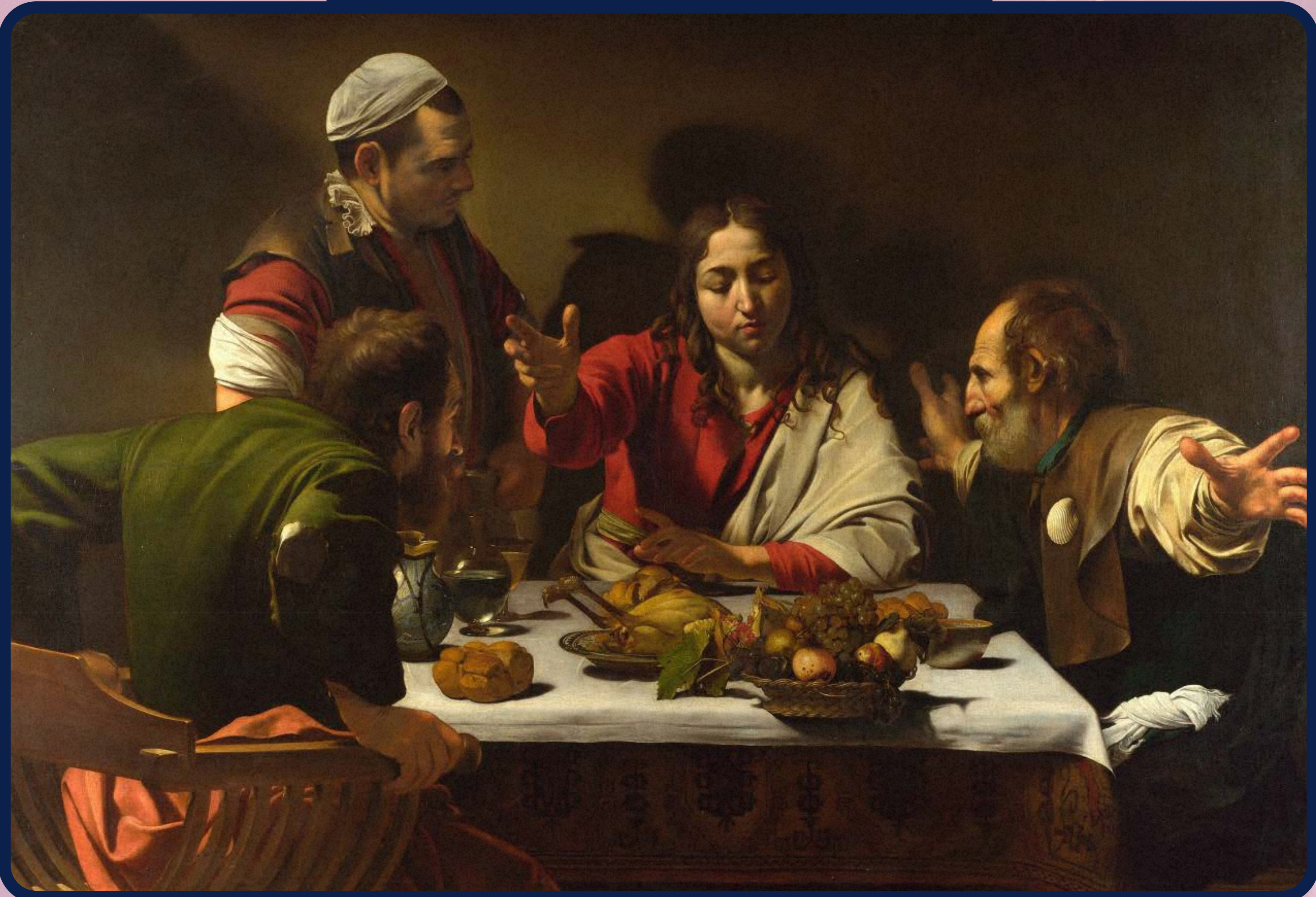
Supper at Emmaus 1601