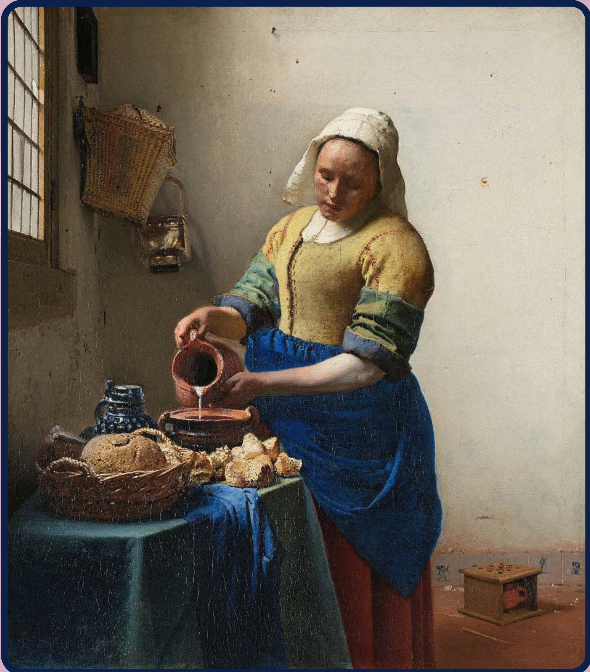
The Milkmaid c. 1658