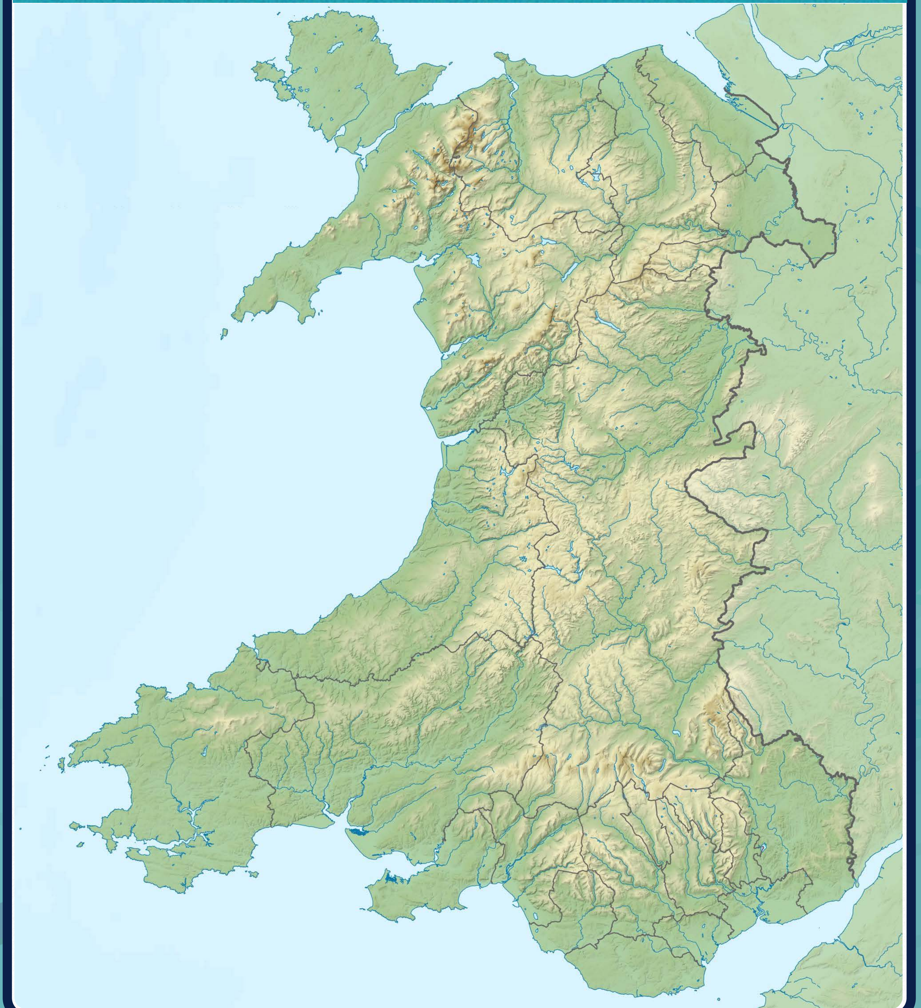
relief map of Wales

a map that uses shading and colours to indicate the height of the land